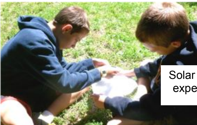
Solar energy experiment