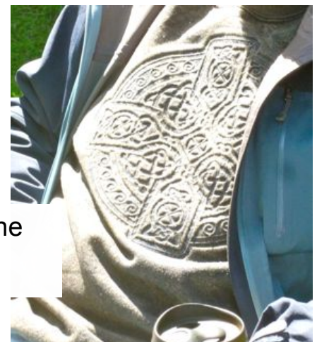
A Celt in the crowd