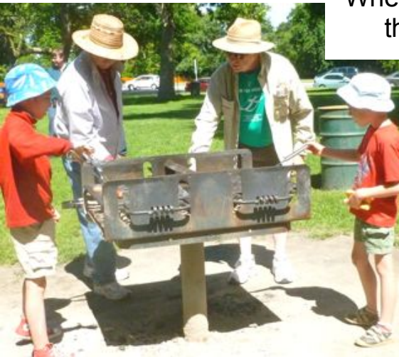
Where there are learners, there are teachers.