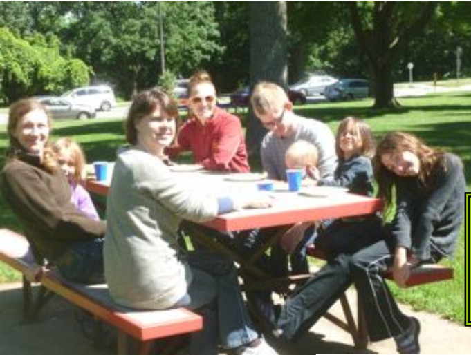
Annual worship in the park and picnic Pray, then play.