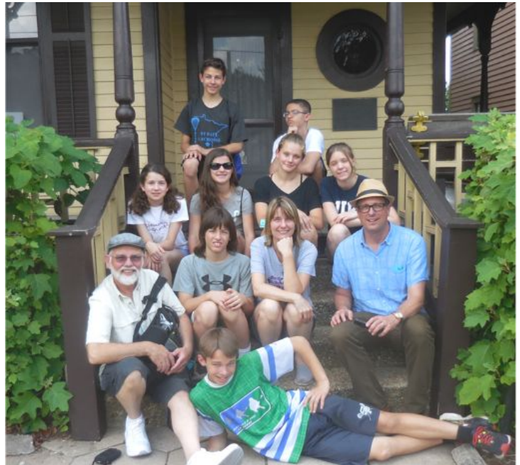
Sitting on the steps of the childhood home of Martin Luther King, Jr.