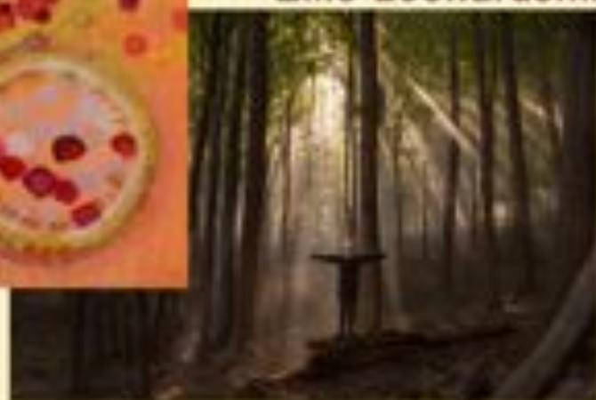
In the Parents Room