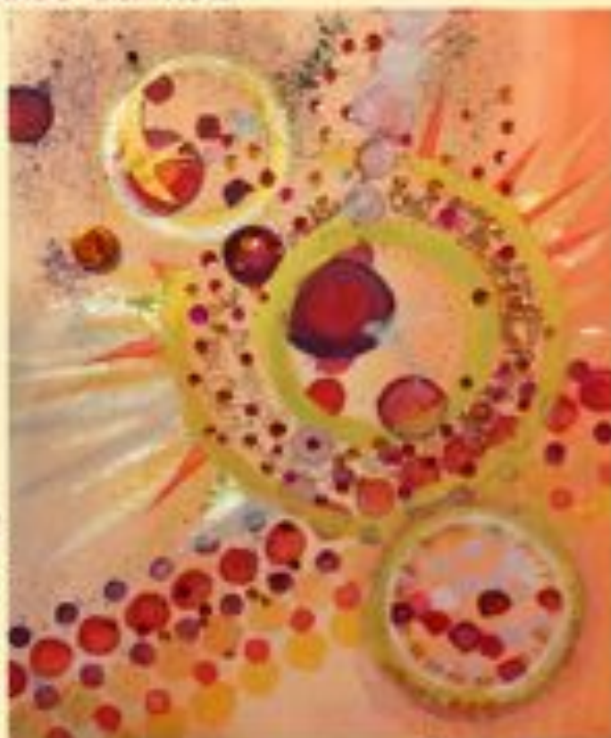
In the Sanctuary