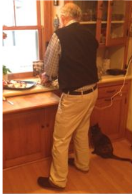
Servant/leader prepares the meal