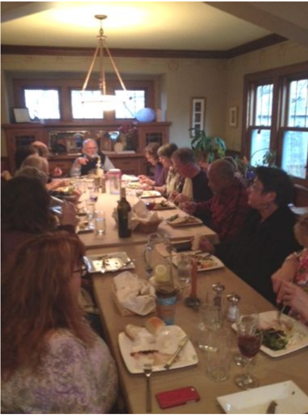
“Last Supper” with leadership at pastor’s home