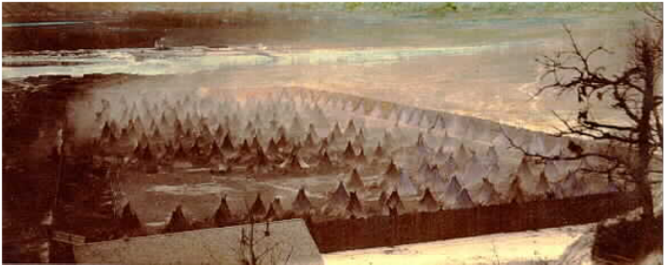
1862-1863 Concentration Camp of 1,600 Dakota interned at Fort Snelling – (women, children, elders)