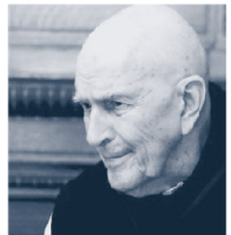
Fr. Thomas Keating