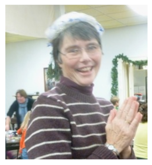
Angels of various ages