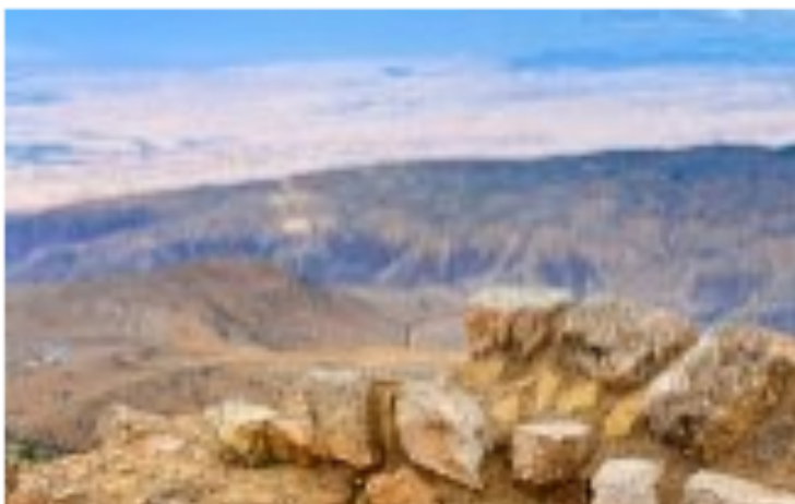
view of Promised Land from Mount Nebo in Jordan