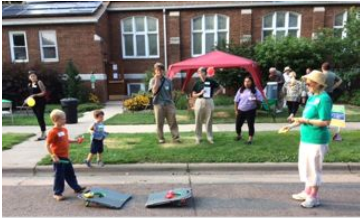
...and Summer Warship & Potluck in the Park