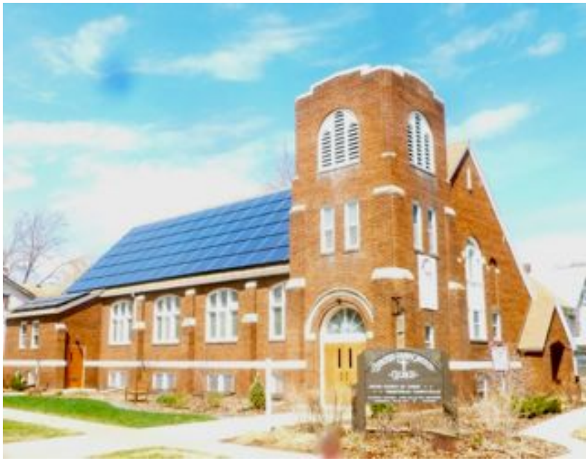
CPUC in June — flowers in bloom.