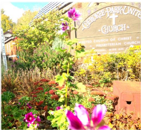
Last of the Fall flowers