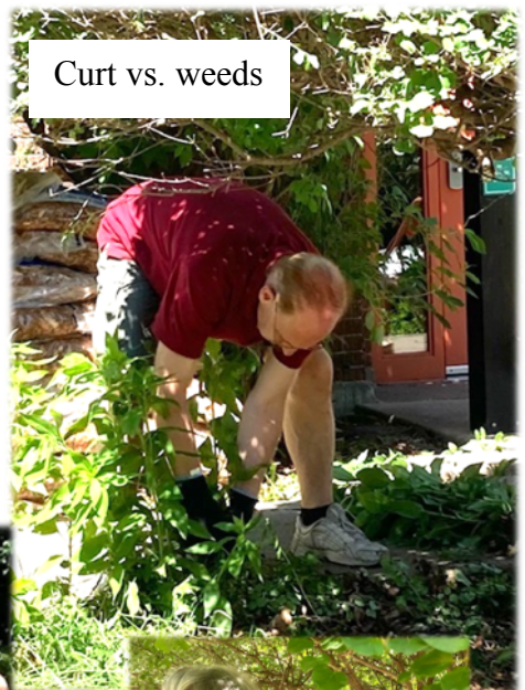
Curt vs. weeds