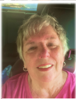
some of us get flushed and tire more easily... first to leave!