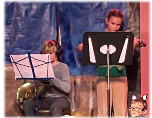
french horn player and violinist