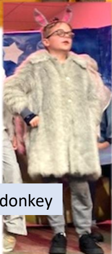
a disagreeable donkey