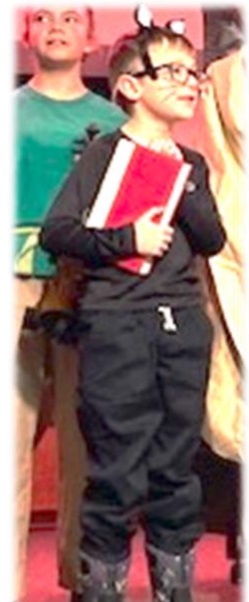
a cat who knew pretty much everything