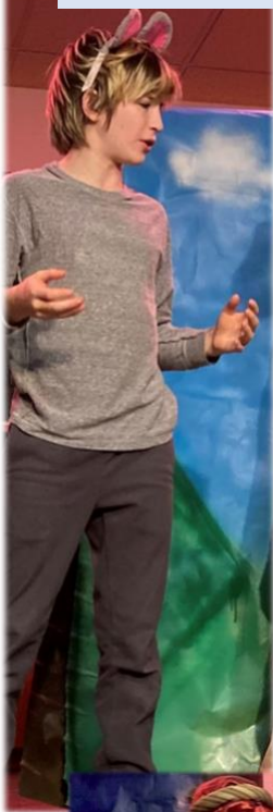
a little field mouse